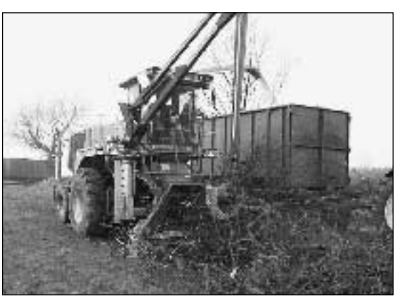
Fig. 1: Application of the chopper at the hedgerows

Wall-hedges or hedgerows typify large areas of the Schleswig-Holstein landscape. The re-growth has to be regularly cut-back and the material therefore represents regenerative raw material. The technical task lies in sawing off the growth, the hedging, and the rational retrieval and preparation for further use of the very uneven material.