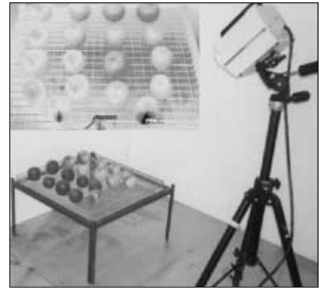
Fig. 1: Thermo vision camera system

The basic aim of this work is the investigation of possible thermography uses in nondestructive determination of product properties and associated procedures for quality retention and the determination of application limits in this context.