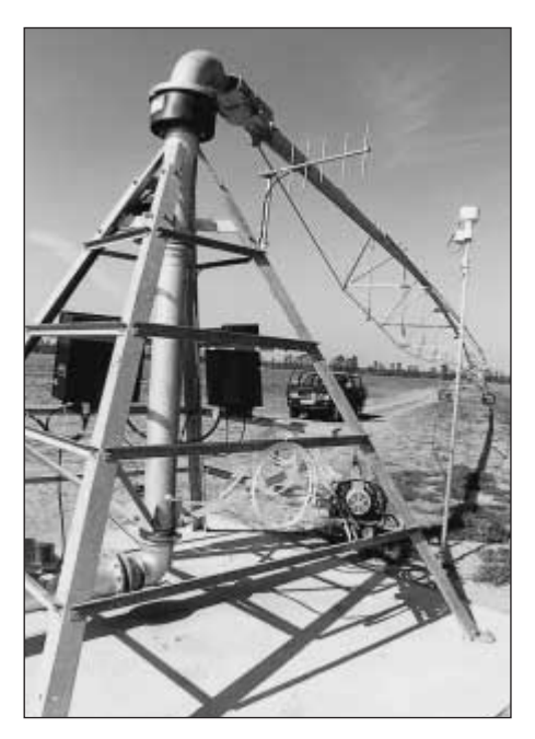
Fig. 2: Communication links at centre pivot irrigation machine

At the end of 2000 a European standardisation group – CEN/TC 334/WG9 "Integrated management system – Data interchange between management and control systems and field remote terminal units". This has set the target of standardising irrigation management and the transmission of performance and working conditions of irrigators and climate stations. This is important because a future farm management will not be able to do without online data for irrigators – be it for monitoring or for operating.