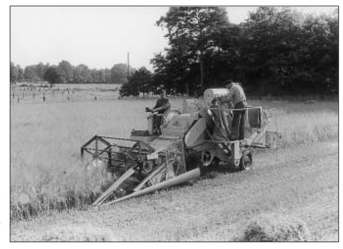
Fig. 3: With the "Huckepack", Claas presented a new Tractor/combine concept.