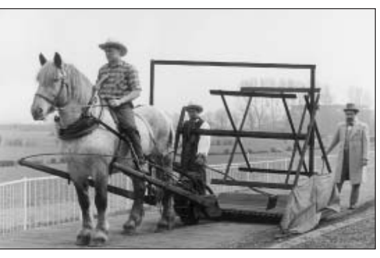
Fig. 1: The first working grain mower from Cyrus Hall McCormick

Since 1987, innovations in agricultural engineering which changed agriculture at their time or at least provided significant progress have been presented here. If one traces back the mechanization of agriculture along the milestones of agricultural engineering 25, 50, 75 years and longer ago, one will notice with astonishment that many ideas and proposed solutions are not as new as they seem.