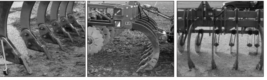
Fig. 1: Front subsoiler with rigid tines and disc coulters

Front subsoiler, slip, fuel consumption, effect of soil loosening