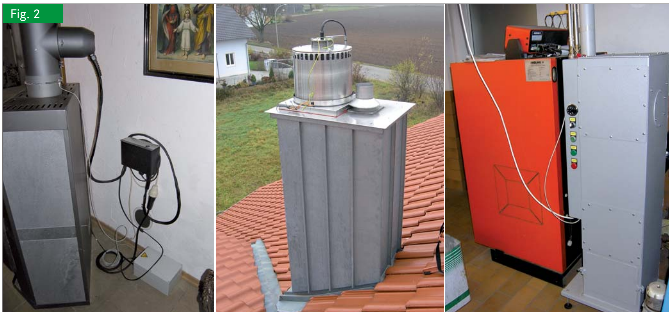
Examples of precipitators used in field tests; left: Zumikron in flue gas pipe of a stove; middle: APP R_{\text{residential}} ESP in chimney top; right: Spanner SFF20 with pellet boiler.