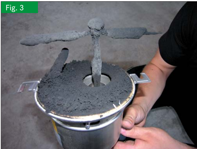
Electrode clamp of the Zumikron ESP, demounted for cleaning after use